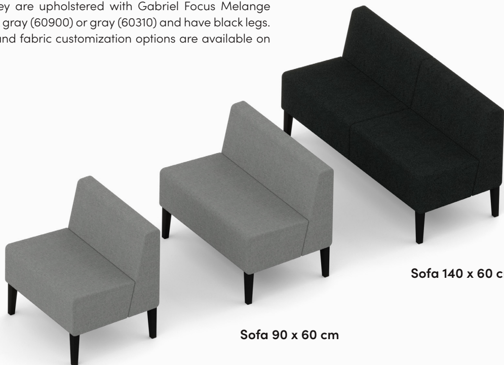
Sofa 70 x 60 cm

Our sofas have a seating height of 46 cm and are easy to combine. They are upholstered with Gabriel Focus Melange fabric in dark gray (60900) or gray (60310) and have black legs. Other color and fabric customization options are available on request.